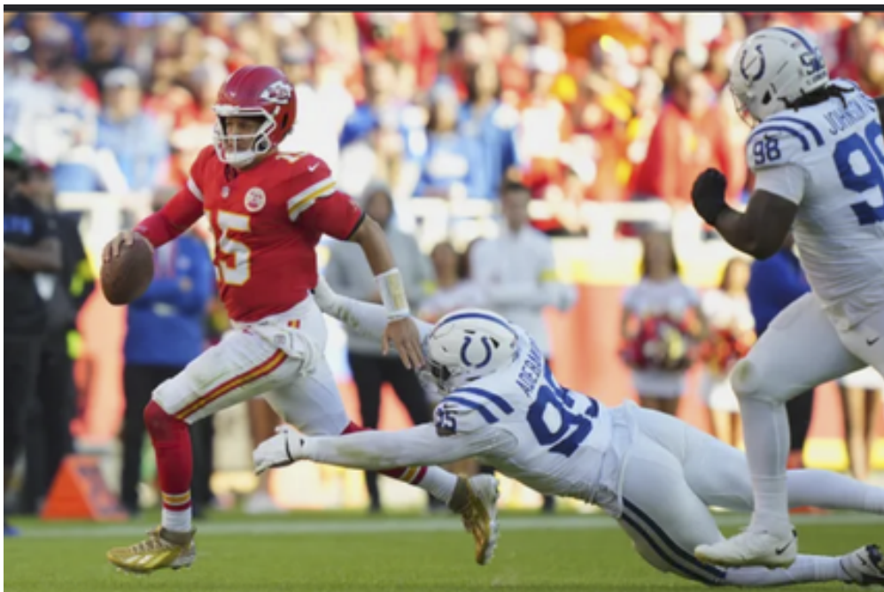
Travelers QB Patrick Mahomes eludes defenders en route to a stellar performance.