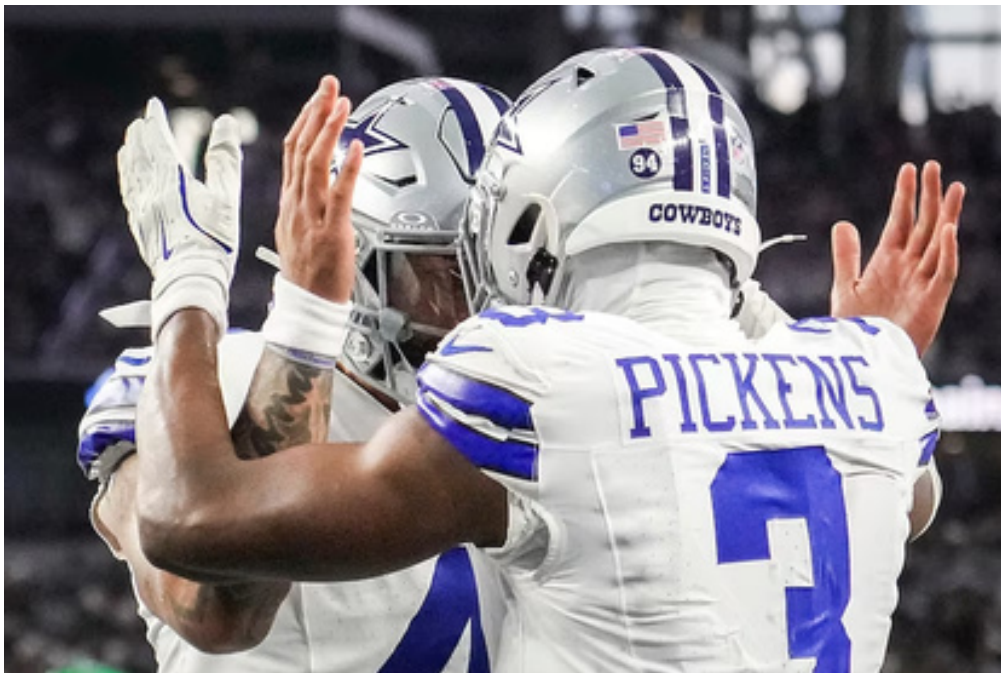
George Pickens celebrates his TD for The Wrecking Crew with Dak Prescott.